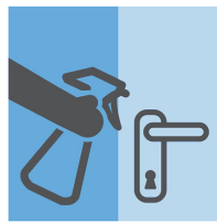
CLEAN AND DISINFECT "HIGH-TOUCH" SURFACES OFTEN