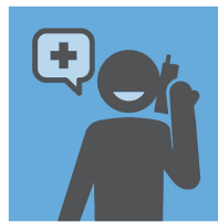
CALL BEFORE VISITING YOUR DOCTOR