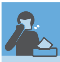
COVER YOUR MOUTH WITH A TISSUE OR SLEEVE WHEN COUGHING OR SNEEZING