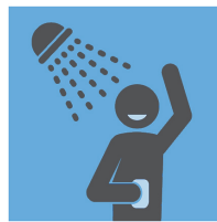
PRACTICE GOOD HYGIENE HABITS

For more information, visit: coronavirus.ohio.gov