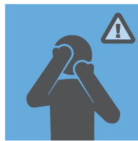
AVOID TOUCHING YOUR EYES, NOSE, OR MOUTH WITH UNWASHED HANDS OR AFTER TOUCHING SURFACES